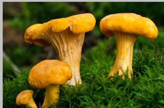
Chanterelles – Edible

Be sure chanterelles you are identifying are not the false chanterelles!