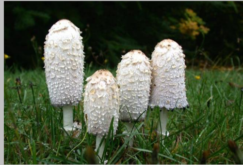
Shaggy Manes - Edible