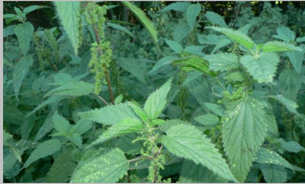
Stinging Nettle for great bone health!